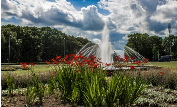
Lennart Tange (image cropped)

Eindhoven is situated in the south of the Netherlands, in the Noord-Brabant region, conveniently close to the borders with Germany and Belgium and excellently served by road, rail and air transport from all parts of Europe. In recent years, Eindhoven, the Dutch city of light, has made its mark as Europe's most influential design city, culminating in the European Design Capital of 2006 award.