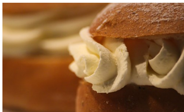
Susanne Nilsson (image cropped)

Make sure that you have enough strength for the day's activities by starting the day with an energizing breakfast buffet and an invigorating cup of coffee.