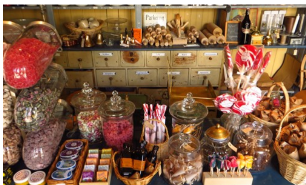
Mr Thinktank (image cropped)

Östersund is a pleasant town to shop in with several of the major Swedish retail chains mixed with lots of small shops along the streets and alleys. The traditional shopping strip is based on Stortorget - follow the pedestrian street to the Domus building and then back along the parallel street Storgatan. Music lovers immediately head for Skivhörnan at Stortorget, one of the few remaining genuine record shops in north Sweden. If you are looking for local delicacies, walk to the farm shop Ost & Vilt at Prästgatan 19, where you can sample and buy products from across the county - everything from selected boxes of delicacies to handicrafts and souvenirs. More souvenirs - mostly local handicraft - are found in Gaupa Hantverk on Z-gränd 1. The shop is run by a cooperative of five local handicraft companies. The outdoor factor is strong in