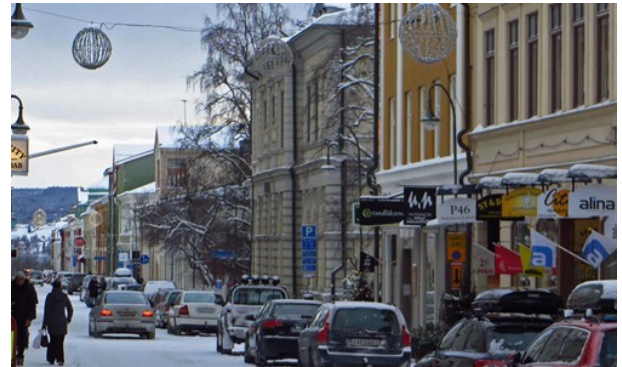
Mr Thinktank (image cropped)

Östersund is a city somewhat shaped by all its students at Mittuniversitetet. This, of course, also affects the night life. You will find lively night clubs, popular pubs and glamorous dance halls - and it is all your choice where to go!