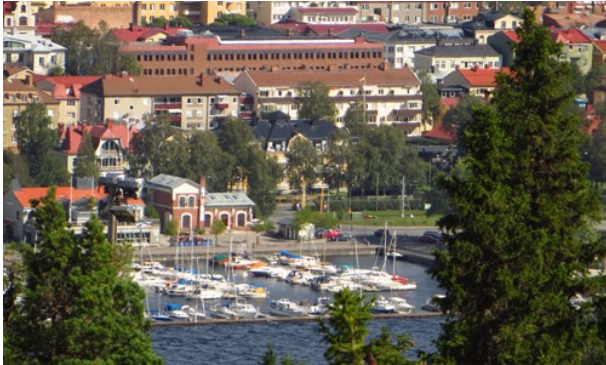
Mr Thinktank (image cropped)

Östersund's central location, almost at the very centre of Sweden, gives the city proximity to both coastal landscape and mountains. The popular ski destination Åre is only an hour by train from the city and to Stockholm it takes about 50 minutes by air (or 5 hours by train). In summertime the city streets are lined by outdoor cafés and people of all ages – from near and far – socializing and making Östersund into a lively city. Storsjöyran, the annual festival, is one of every summer's highlights. During the dark winter season, it is, besides the possibility to outdoor activities and the white snow, theatre performances, concerts and the troubadours, and not at least the chance to see a crackling Northern light that makes Östersund to a city to feel welcome in. The city of Östersund was founded in 1786, and was at the beginning a typical settlers community where lawlessness is said to have been widespread. Illegal bars were common and the streets were pitch black after nightfall. As late as in 1876, the first kerosene lamp appeared on the street! By the middle of the 19th century, trade and craft slowly increased and by the beginning of the 20th century several stately buildings had been erected as a sign of the increasing prosperity. 50 years later, Östersund was a military city with thriving industries. Today, Östersund is one of most pleasant Northern, medium-sized cities.