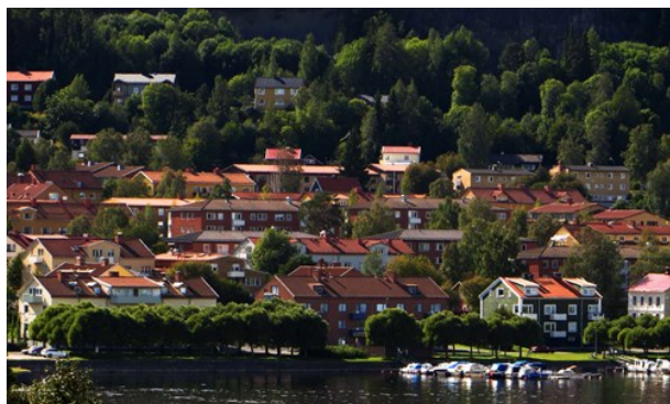
Mr Thinktank (image cropped)

There is always something to do in Östersund. Below is a selection of activities and interesting sites to visit.