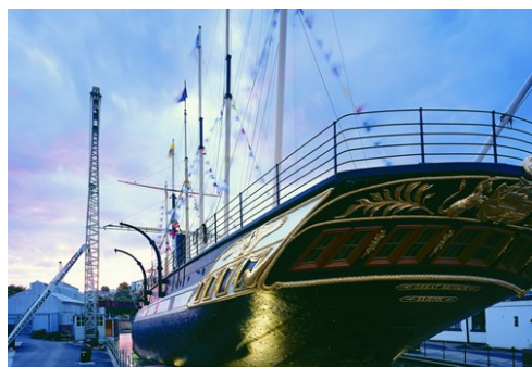
Brunel's ss Great Britain