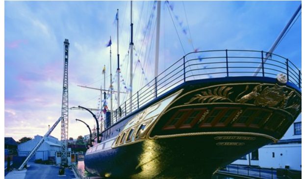
Brunel's ss Great Britain

There's so much going on in Bristol, the challenge is deciding what to see first! You could spend hours just exploring the Harbourside. The historic dock is now home to Victorian engineer Isambard Kingdom Brunel's ss Great Britain, The Matthew, the Arnolfini art gallery and M Shed museum.