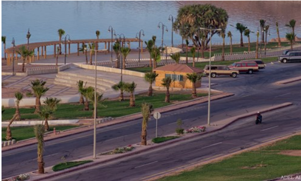
ADEL AL-OMRANI (image cropped)

The earliest mentions of Tabuk (known back then as "Taboo") date back to 1500 BC, but events of historic significance have started unfolding here as early as 8000 years ago. Tabuk is believed to have been home to prominent Islamic figures such as Prophet Shuaib and Prophet Moses - the natural springs used by the latter are still open to the public today, and are just one of many sacred sites in the region.