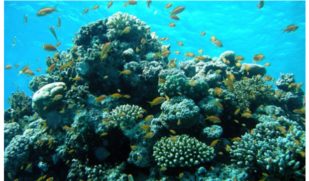
Matt Kieffer (image cropped)

Those looking for an active holiday can choose between climbing up the mount of Jabal Al-Lawz and trekking or island hopping along the coast and descending underwater for diving sessions conducted by one of many professional dive centers. If you prefer to stay on land, venture upstate to the region's capital - Tabuk City, or pay a visit to the historic town of Al Bida that still holds evidence of ancient presence in its mountain caves. Other archaeological sites include those in the towns of Al Muwailih, Al Khuraibah, Rawwafa and Al Muzim.