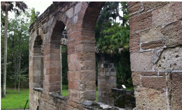
jamalfanaian (image cropped)