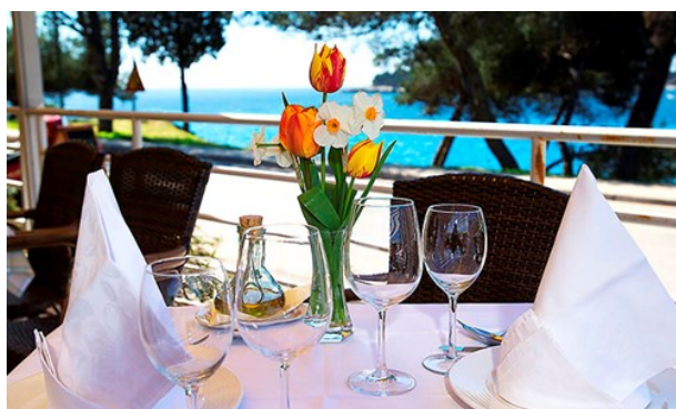
Istria Tourist Board

As a result of its proximity to Italy and its wealth of glorious coastline, Istria has a varied, fresh and sophisticated cuisine which draws on