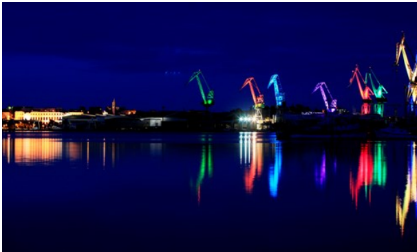
Istria Tourist Board

The ancient town of Pula has been inhabited since 1000 BC. Roman expansion into the peninsula in the first century AD has left the city with many of its most glorious monuments, including the world-renown amphitheatre which hosts the city's annual opera festival every summer. After the fall of Rome, Pula passed through the hands of various warring groups including the Ostrogoths and the Franks before becoming part of the Venetian republic in the 12th century, leaving the port city with an eclectic mix of cultural influences which can be seen in the architecture of the city today.