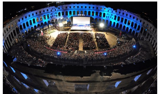
Istria Tourist Board

Laws in Pula restrict bar opening hours, meaning that most venues are closed by midnight and nightlife is limited to a number of bars in the Veruda area of the city as well as a few larger clubs northeast of the centre. Although local law forbid city-centre bars from opening beyond midnight, Pula does have a number of sociable and picturesque venues just outside the middle of town.