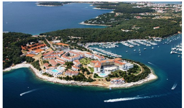
Istria Tourist Board

Pula has a mix of accommodation in and around Pula in every categories. You can find many hotels in the centre and large resort hotels in the area called Verudela. For beach holiday the hotels around Verdula would be a great choice due to the easy access to the beaches and sport activities. If you desire to experience the "real Pula" and check out the museums then it is advised to stay in the town centre.