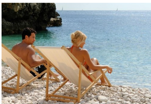
Istria Tourist Board

Jewel of the verdant peninsula of Istria, Pula is the province's largest city and forms a dramatic gateway to the seductive, crystalline waters of the Adriatic. Situated at the southernmost tip of the area, which has come to be known as 'the new Tuscany' for its bright medieval hilltop towns and ancient ruins, Pula boasts a rich and varied cultural heritage. The city is bordered by national parks remarkable for their astounding unspoilt natural beauty and is celebrated for its wonderfully preserved Roman amphitheatre and forum, which form a dramatic backdrop for leisurely strolls from the old town to the coast.