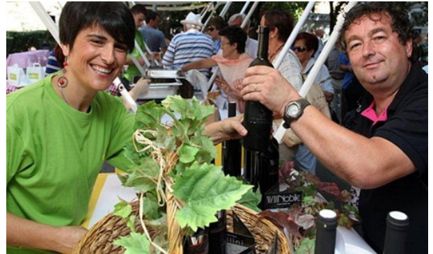
Istria Tourist Board

Pula's bustling central market is built in the heart of the city and is home to a wide range of modern and traditional shops. Under the glass arches of the 19th century iron framed covered market, you will find the area's largest fish market, which is best visited early in the morning when the brackish catch of a truly vast range of seafood is at its freshest. Look out for Brancin (sea perch) and fresh Dagnje (mussels), which are specialties of the region.