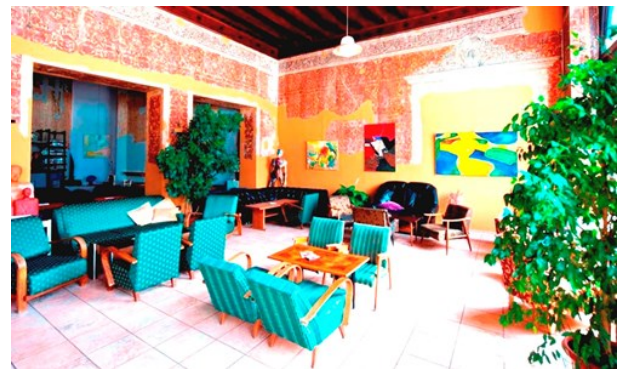
Istria Tourist Board

Relax in one of the places and enjoy coffee or tea after a full day of historical sightseeing. You will find many coffee shops on the street Forum, where the Temple of Augustus stands, a square described as a bustling piazza with many nice venues.