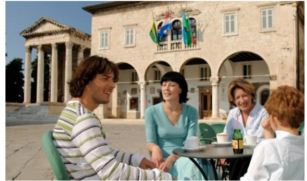
Istria Tourist Board

Pula offers a mixture of attractions for those interested in culture and history. Here you can see beautiful attractions like the Roman Amphitheatre, Ancient Cathedral, Old Town and the Temple of Augustus. Pula also offers fun family entertainment like the Aquarium with open tank with all kind of sea life. A great tourist asset is Pula's 190 kilometre of coastline with crystal clear sea and beaches that suit everyone's needs. If you would like to go for a short trip then Brijuni National Park is a great choose, located in an island close to Pula.