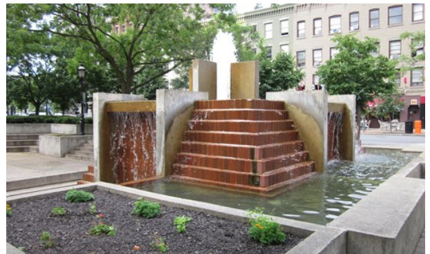
Doughtone (image cropped)

Syracuse is a town full of history and beauty. Visit one of Syracuse's many museums or historic districts to learn more about the city. For a relaxing day, there are several things to do at one of the area's more than 50 states, county and city parks.