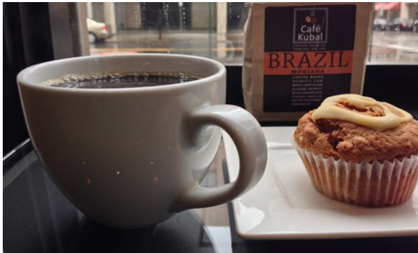
Kai Brinker (image cropped)

Any of these cafes is a great stopover from a day of exploring the city. Grab a cup of coffee, indulge your sweet tooth or enjoy lunch in a cozy atmosphere. You might even be lucky enough to hear some live music.