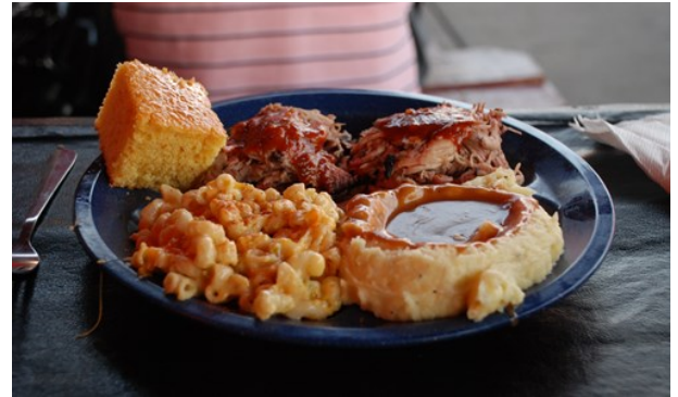
Joe Shlabotnik (image cropped)

Two words sum up the philosophy of most food in Syracuse—fresh and local. Although there are several pubs located in Syracuse, you will find more than just typical bar fare here. Each restaurant adds its own flair to its cuisine, and, because of the city's rich cultural diversity, there is also a variety of authentic world cuisine available.