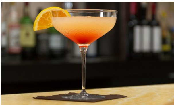
Didriks (image cropped)

The bar scene in this college town is mostly laid back. With a number of local breweries like the Empire Brewing Company and the Syracuse Suds Factory, Syracuse is serious about its beer and there is always competition to see who has the biggest and best beer selection. If you're looking for a night of dancing, head over the World Lounge and Martini Bar.