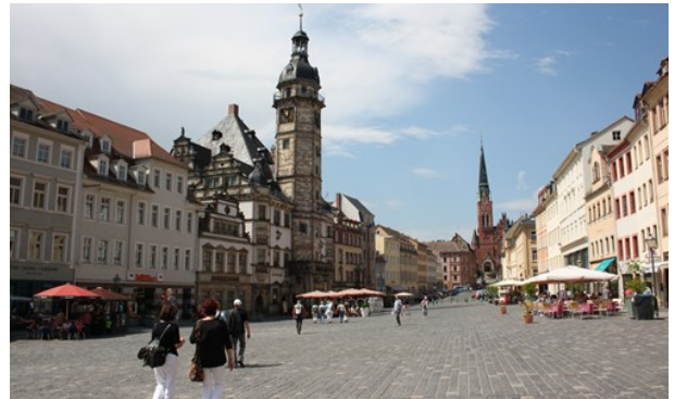
michimaya (image cropped)

There are plenty of opportunities for purchasing local wares and beverages together with beers and schnaps at the Brewery Museum. The main shopping area is on and around the five historical marketplaces of the old town and within easy walking distance. Altenburg Liqueur can be obtained in many different varieties from the Distillery. Altenburg mustard comes in more than 150 varieties and is available from the Mustard Shop on Moritzstrasse.